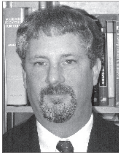
BY DAVE EDYBURN

Many students with disabilities struggle to learn commensurate with their abilities. When a student with a disability struggles to read at grade level, write sophisticated prose, or display automaticity in basic math algorithms, such challenges follow him from classroom to classroom, day after day, year after year.